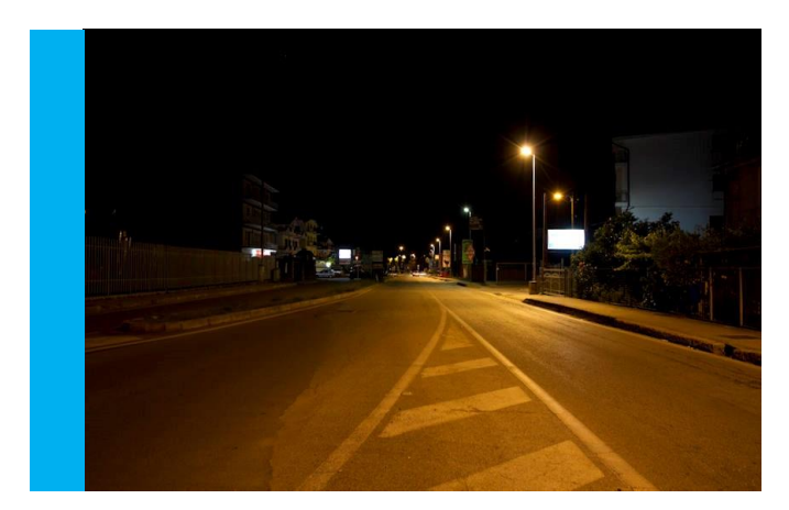
Before installation of Grah LSL® 60