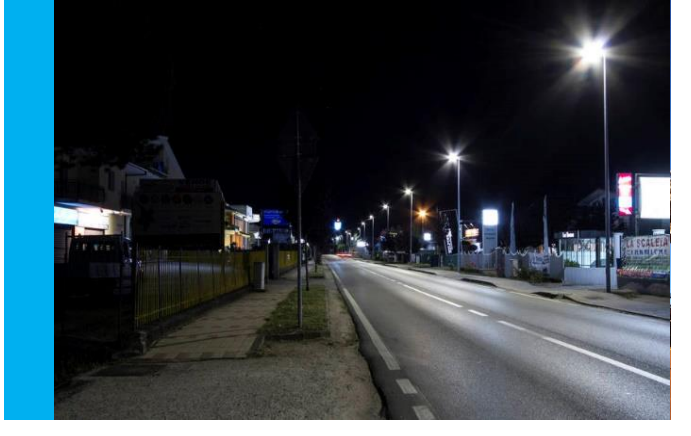
After installation of Grah LSL® 60